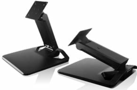
Lenovo® Universal All-in-One Stand