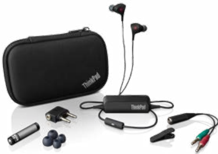
ThinkPad® Noise-Cancelling Earbuds