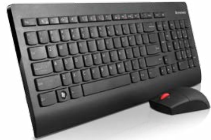
Lenovo® Ultraslim Wireless Keyboard and Mouse Combo