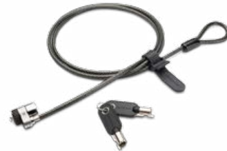
Kensington® MicroSaver Security Cable Lock by Lenovo®