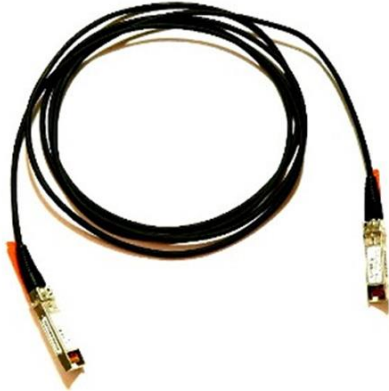
Figure 2. Cisco Direct-Attach Twinax Copper Cable Assembly with SFP+ Connectors