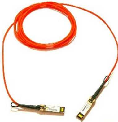
Figure 3. Cisco Direct-Attach Active Optical Cables with SFP+ Connectors

Cisco SFP+ Active Optical Cables (Figure 3) are direct-attach fiber assemblies with SFP+ connectors. They are suitable for very short distances and offer a cost-effective way to connect within racks and across adjacent racks. Cisco offers Active Optical Cables in lengths of 1, 2, 3, 5, 7, and 10 meters.